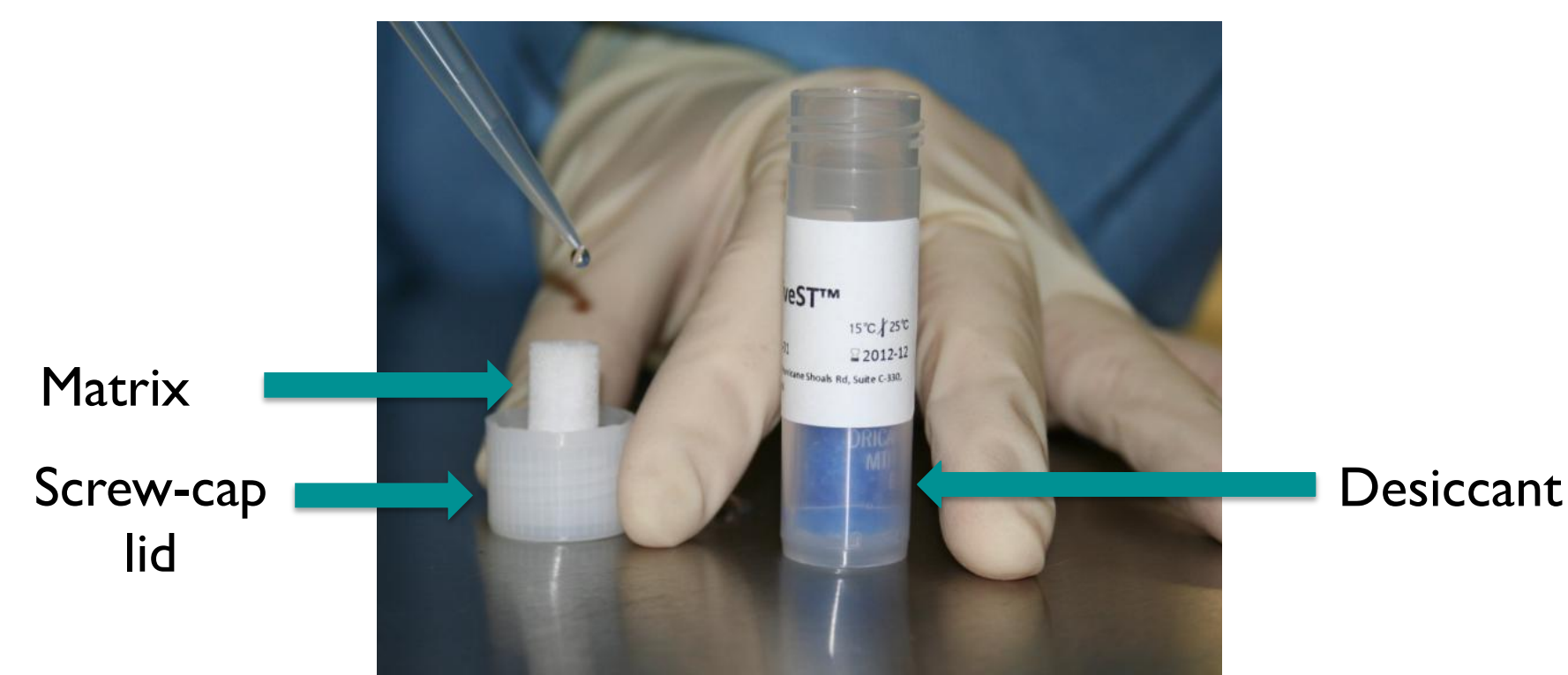
Figure 1. Loading of Plasma onto ViveST Matrix